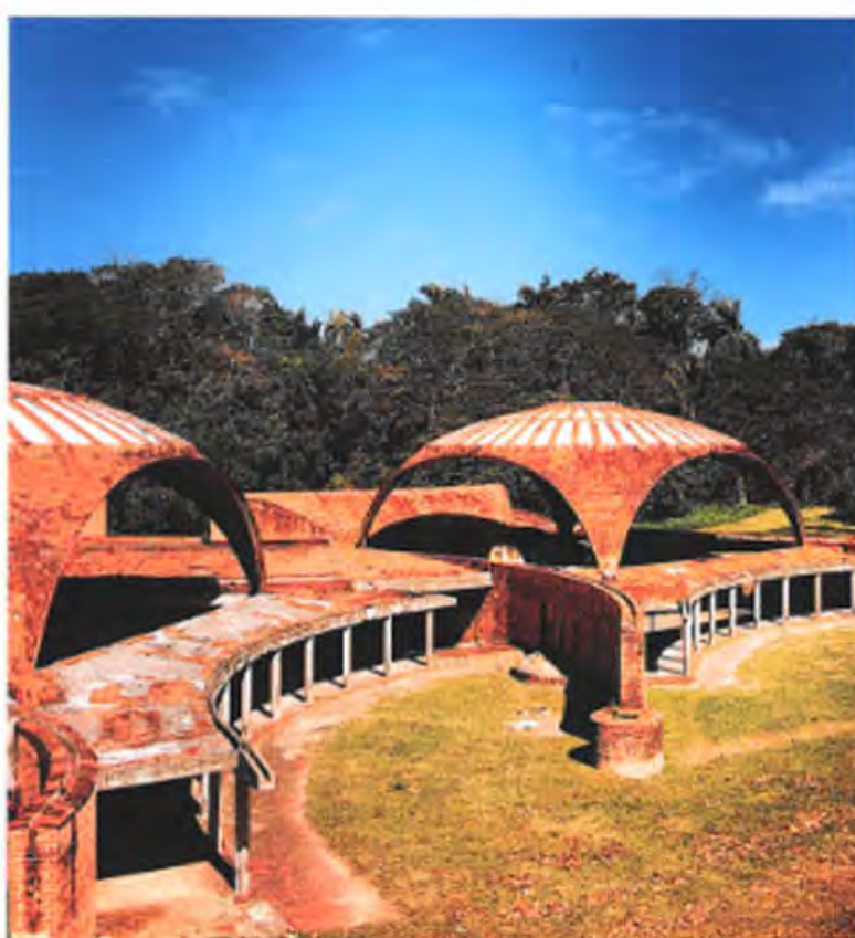
THE NATIONAL ART SCHOOL, HAVANA