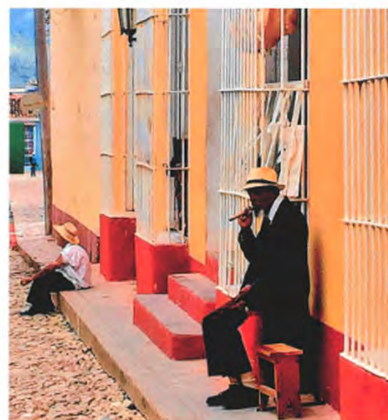
STREET MUSICIAN IN HAVANA