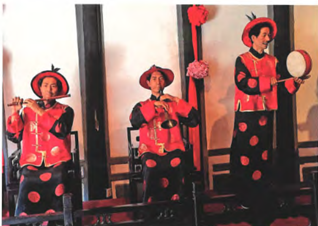
MUSICIANS, WUZHEN, CHINA