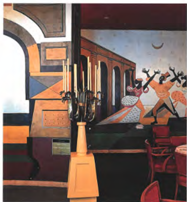
HAVANA RIVIERA HOTEL